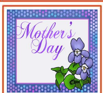
WIS Mother's Day Assembly has become a huge annual event in which students take the opportunity to thank all the mothers for what they do.

On Friday 4 May students from Prep – Year 5 participated in a healthy breakfast which was part of the Year 2's unit of inquiry on keeping your body healthy. Students were asked to bring healthy food for a shared breakfast. After the breakfast students participated in different sports activities.